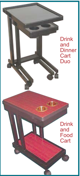
Drink and Dinner Cart Duo